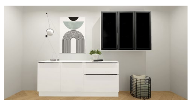
Floor-standing design featuring a sideboard and display wall units, Dimension approx. 300 cm.