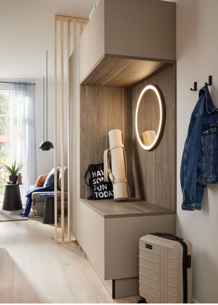
Coordinated with each other: The decor of the kitchen is reflected in the entire apartment.