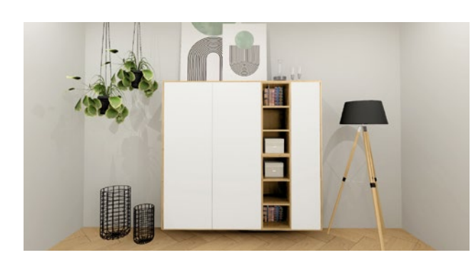
Wall-mounted cabinetry of a highboard with an open shelf unit, Dimension 160 cm.