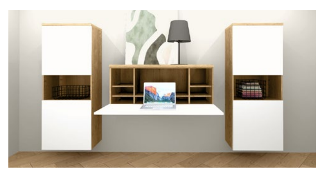
Wall-mounted cabinetry with the "mobile working" wall unit and two highboards, Dimensions approx. 290 cm.