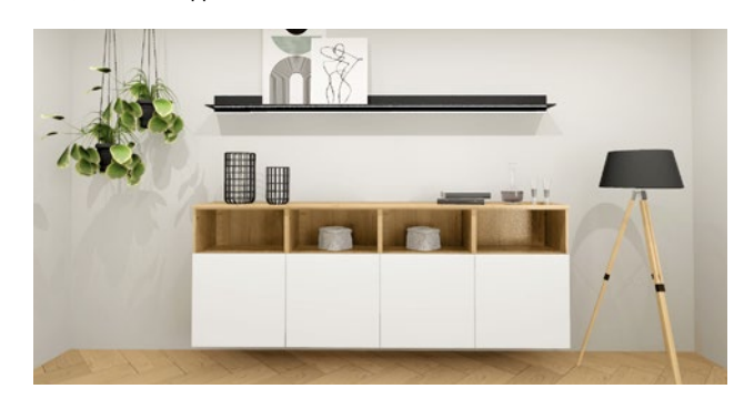
Wall-mounted cabinetry featuring a sideboard and an LED wall shelf, Dimension approx. 240 cm.