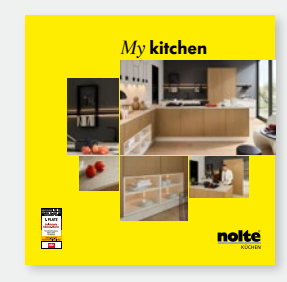
All information for planning the perfect kitchen.

Information material for the perfect planning of your kitchen!