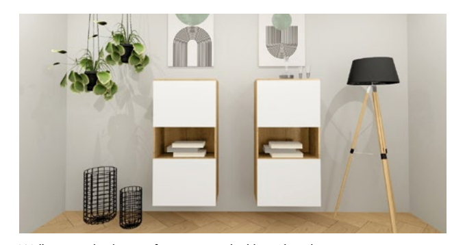
Wall-mounted cabinetry featuring two highboards with open compartments, Dimension approx. 150 cm.