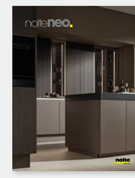
nolte neo – an extraordinary design.