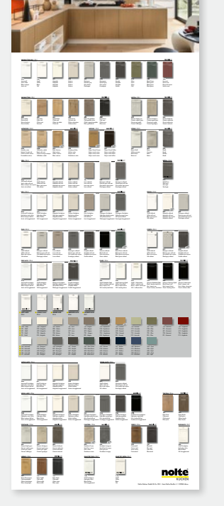
Overview of our fronts, colours and decor finishes.