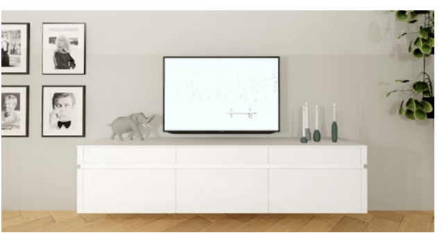
Wall-mounted cabinetry of a MatrixArt lowboard with pull-out units, Dimension approx. 250 cm.