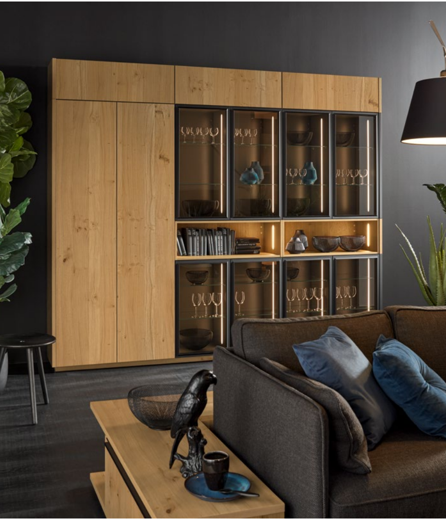
Tailored to your needs and situation, furniture for all parts of the home.