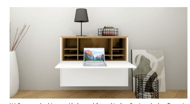
Wall-mounted cabinetry with the "mobile working" wall unit and a bar flap unit, Dimension approx. 120 cm.