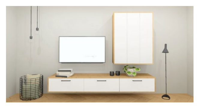
Wall-mounted cabinetry with a lowboard featuring pull-out units and high wall units, Dimension approx. 242 cm.

This is where you can find a number of planning examples illustrating some of the options you have. These are representative of an almost infinite number of possible combinations and configuration options.