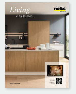
The Nolte Küchen Journal – be inspired!