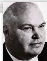
Konrad Nolte 1916 – 1983

A chipboard production was opened. By introducing assembly line technology, he revolutionized the global furniture industry worldwide.