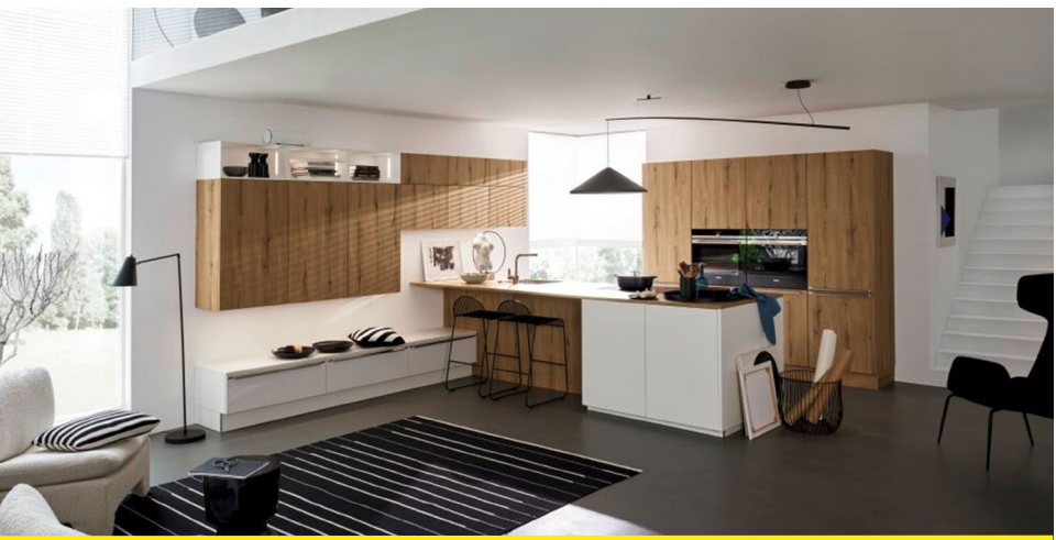
MANHATTAN Volcanic oak – an authentic reproduction