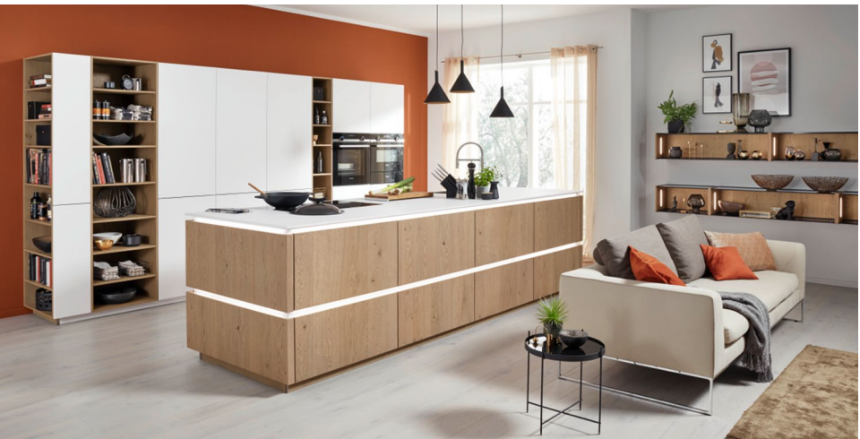
TAVOLA Oak pinot – the high-quality original